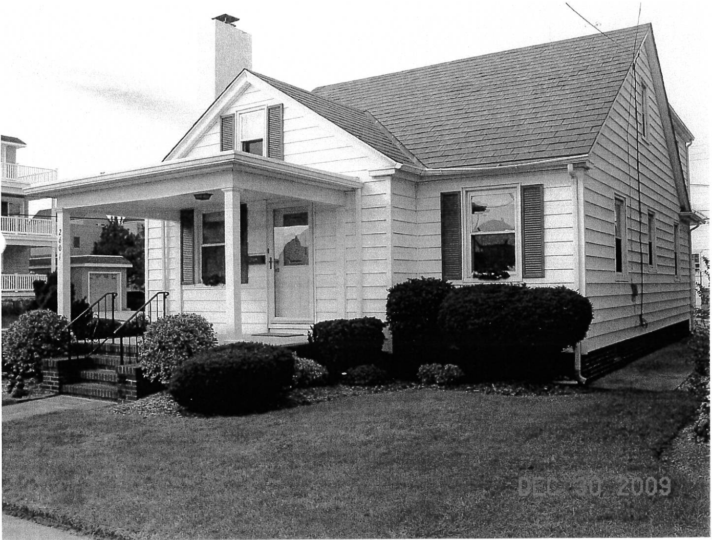
View Front/Right Side

If using the Elevation Certificate to obtain NFIP flood insurance, affix at least two building photographs below according to the instructions for Item A6. Identify all photographs with: date taken; "Front View" and "Rear View"; and, if required, "Right Side View" and "Left Side View." If submitting more photographs than will fit on this page, use the Continuation Page, following.