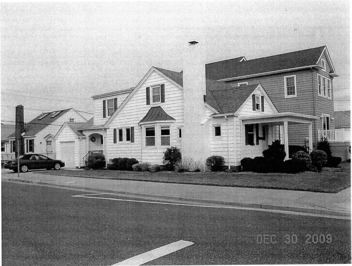
View Left Side

If submitting more photographs than will fit on the preceding page, affix the additional photographs below. Identify all photographs with: date taken; "Front View" and "Rear View"; and, if required, "Right Side View" and "Left Side View."